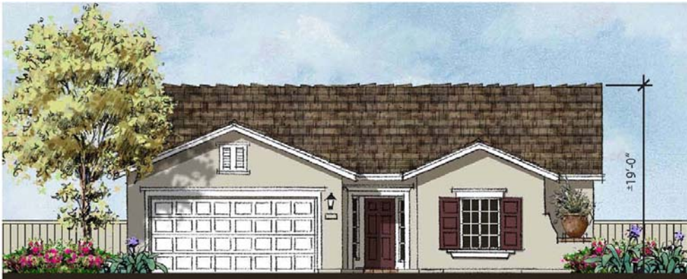
THE SCARLET - PLAN 2B 4 BEDROOM, 2 BATH, GREAT ROOM 2 CAR GARAGE 1,742 S.F.

Phone: (209) 969-6703 Fax: (209) 824-4469 www.FlorsheimHomes.com